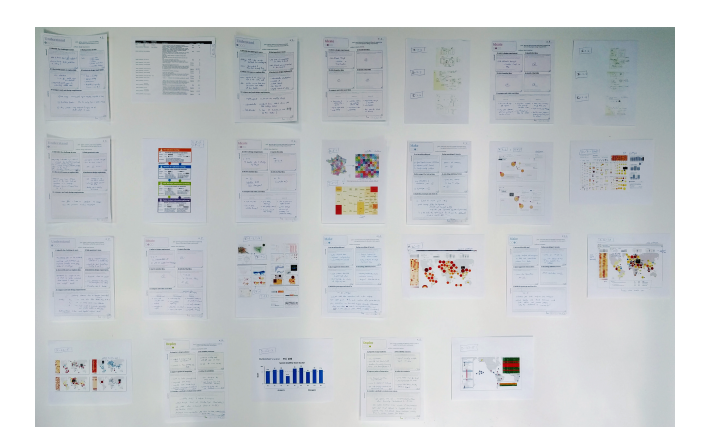
Figure 2: Design worksheet examples. We created example worksheets using linked sketches from our BubbleNet dashboard project [16]. With this example, we taught students visualization design and showcased how a real-world, iterative design process can be captured using the worksheets. A detailed copy of each worksheet and all sketches are included in the Supplemental Materials.

Table 1: Five steps for each design activity. We break down each visualization design activity [15] into five concrete steps. The first four steps of each activity are generative, to establish design requirements, encoding and interaction sketches, visualization prototypes, or visualization systems. The fifth step is always evaluative, to compare different visualization artifacts in order to justify design decisions and record that reasoning down for later use. We shared these five steps with novice visualization designers, students, using design worksheets as a template, as in Figure 1.