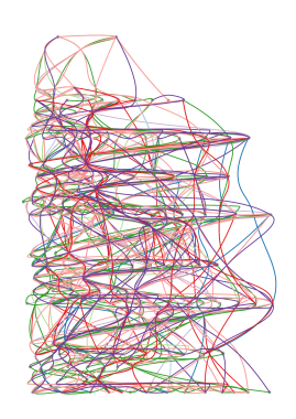
Figure 3: The beautiful mess feature of Poemage applied to Clark Coolidge's "Machinations Calcite." Development of this feature exhibited elements of reciprocal shaping (P3) and guided emergence (P6).

tal humanities. On the other end, visualization researchers learned to embrace the poets' broad and imprecise definition of rhyme and developed an openness to deviating from conventional visualization methods and principles. Additionally, visualization researchers learned to incorporate a more extemporaneous element into their research — one that reflected the nature of their collaborators' poetry scholarship. Furthermore, revisiting a close reading of a particular poem, and the particular analysis that led to a new interpretation or insight, was a regular tactic used by poetry scholars to illustrate a point. Thus visualization researchers had to develop enough of an understanding of poetry, poetry analysis, and close reading in order to interpret the point being made, and translate it to the space of visualization research.